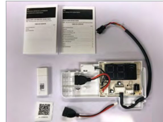
Wi-Fi® Kit Part# KSAIF0101AAA