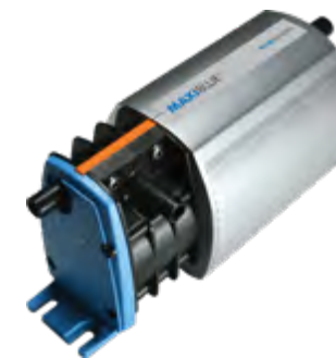
Maxi Blue 230V Condensate Pump Part# X87-721