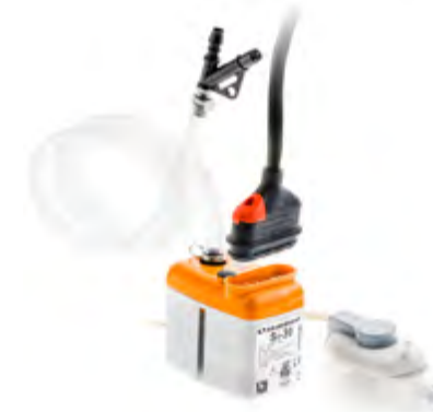
Mini 115V Condensate Pump Part# SI3000-115V